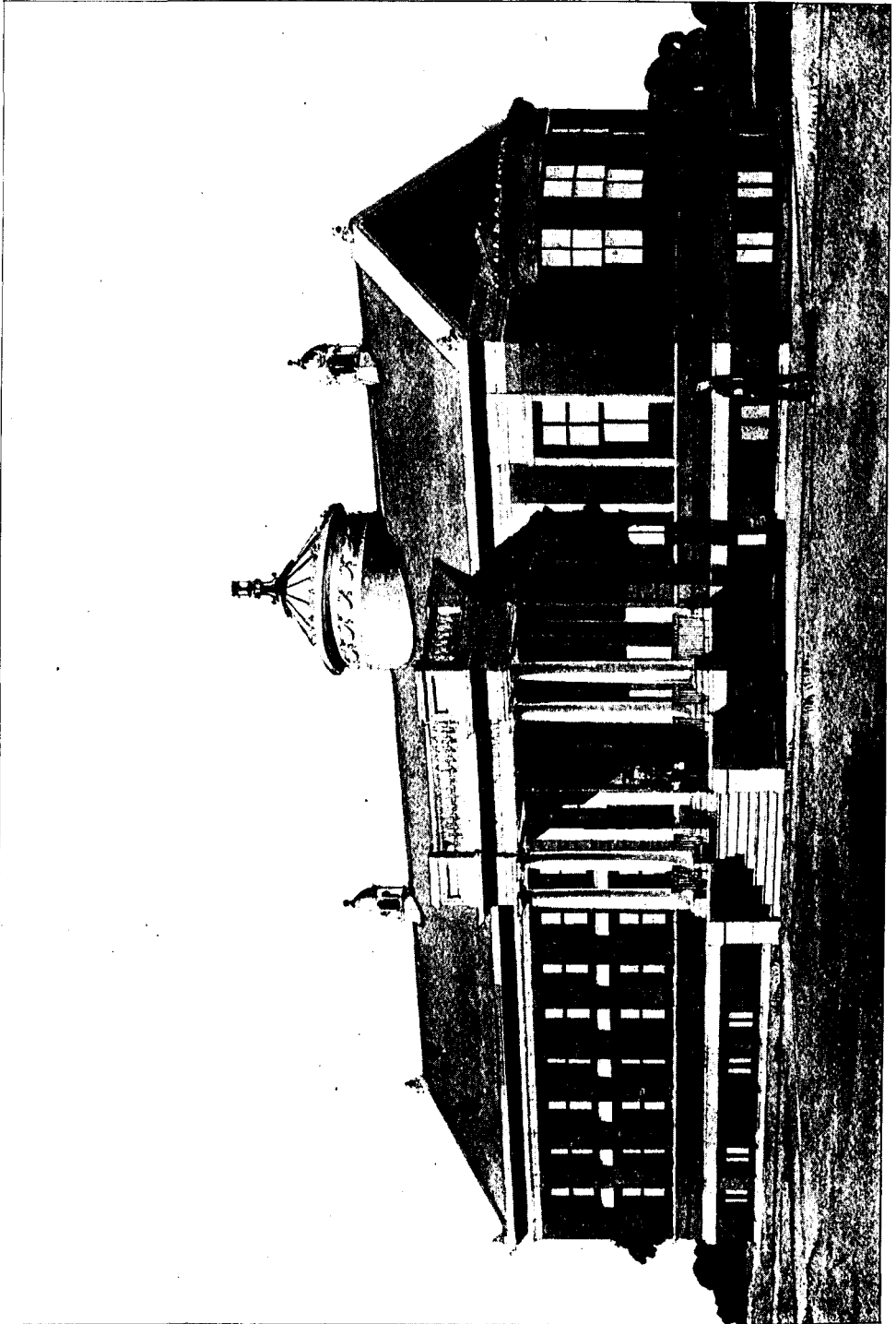
VAIL MEMORIAL LIBRARY.